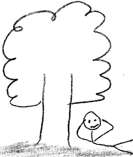
Body 1: Natural State